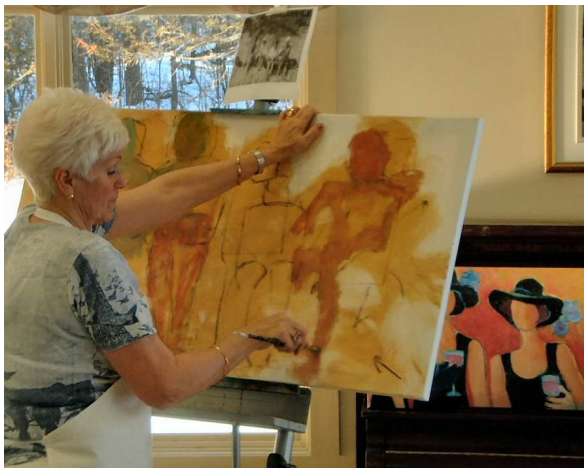
Figure 5 - Colour is Added to Check Composition