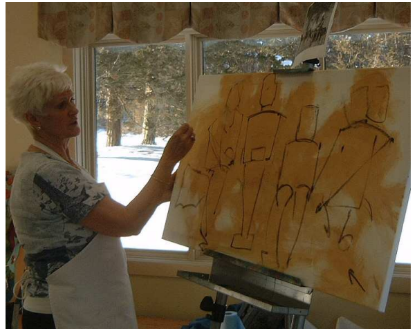
Figure 4 - Charcoal Outlines for Figures