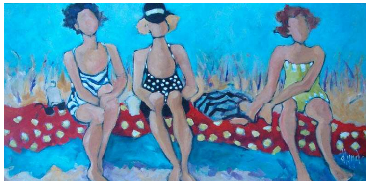
Figure 7 - Completed Painting Showing the Rich Colour Choices.