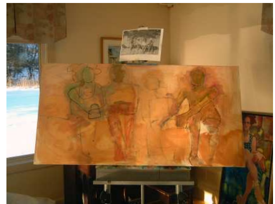
Figure 6 - The Composition Established by End of Demo