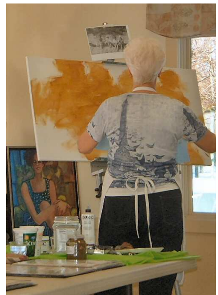
Figure 3 - The Initial Underpainting is Quick and Sweeping

raw sienna, red, grey and grey-green plus white. She started the compositional stage by using raw sienna, although any colour can be used, to block in the big shapes and gestures. These were done with sweeping strokes of a large mop brush (Fig. 3). It is important to capture some idea of motion and body language. Donna normally leaves faces undefined for a group setting but emphasizes body language. When the subject is a single person, facial features are prominent.