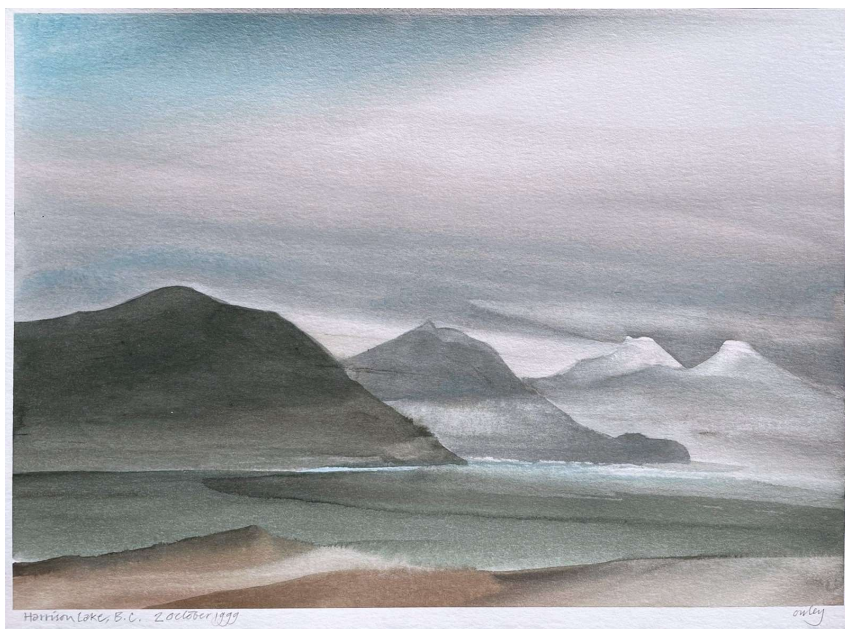
Harrison Lake, BC. - Wallace Galleries, Calgary— https://wallacegalleries.com

April 11: RLAA general meeting, North Crosby Hall, Westport. 1 p.m.