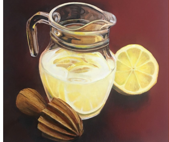
When Life Hands You Lemons (Barb Rielly)

match water-mixable paints and additives with no issues (so far). Can you mix traditional oils with water-mixable oils? You can add a bit of one to the other in a pinch but no amount of