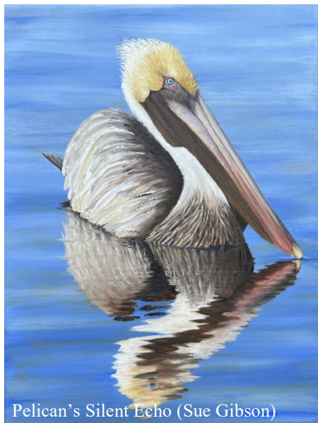
Pelican's Silent Echo (Sue Gibson)

water-mixable oils will make traditional oils water soluble and frankly the mix can be sticky and messy.